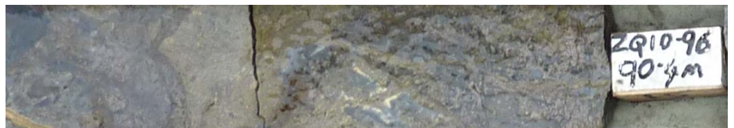
Core sample from interval 90-91m grading 3.5% tin – hole ZQ96